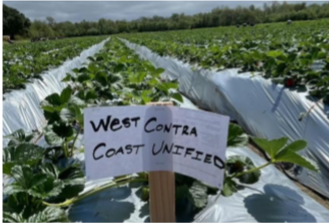
Strawberries growing for WCCUSD

To secure organic produce supply, CK understands schools' needs and compiles demand forecasts to communicate with farmers. Conscious Kitchen works hand-in-hand with school food service teams to collect weekly/monthly volume needs and communicate that with farmers to influence planting and harvest calendars. Our team has influenced the growth of items such as romaine lettuce, sugar snap peas, strawberries and tomatoes, popular items, with our farmer network to guarantee annual volume and lock in fair pricing. This program will continue to expand exponentially in the 2024/2025 school year.