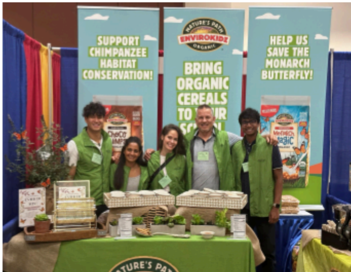
Nature's Path and Conscious Kitchen teams at the California School Nutrition Association Conference 2023