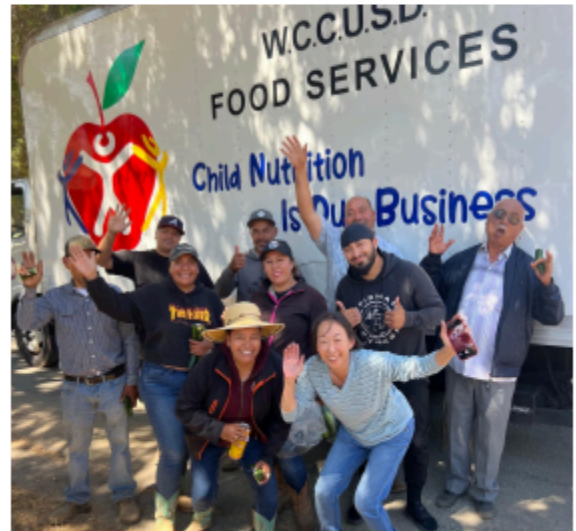
Central Coast Farmers loading up fresh local organic bounty for WCCUSD