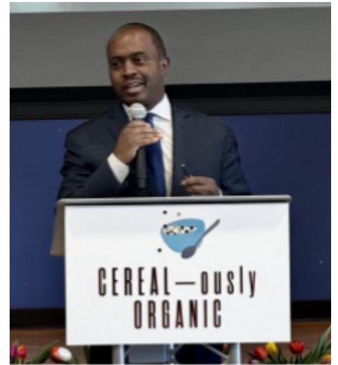
Tony Thurmond at launch of the first organic K-12 cereal, developed by Nature's Path

Thurmond has committed to supporting California to to move all school districts towards 100% organic meals!