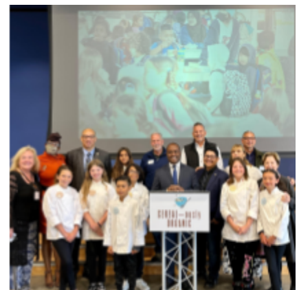
Launch of Nature's Path Monarch Butterfly and Choco Chimps at the Cereal-ously Organic event at WCCUSD in May 2024