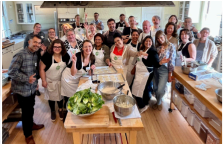
Food Service Leaders, Organic Farmers, and Farm-to-Table Chefs at the First Fresh Local Organic Culinary Workshop