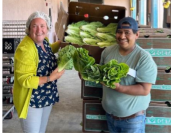
Delivery of Romaine grown for WCCUSD